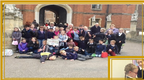
Phoenix Class cre-

It is hard to believe that our first term is nearly over. We have crammed in so much and the children have had so many fantastic learning experiences, although I'm sure that they are now ready for a rest and to re-charge batteries. Autumn is certainly with us, and the nights are starting to draw-in. Our after school sports clubs will still take place and please be mindful of weather changes and the need for warm clothing. I always remember Bonfire Night as the start to the countdown to Christmas and we will be in full Christmas mode, getting ready for our Nativity and our various Christmas performances.